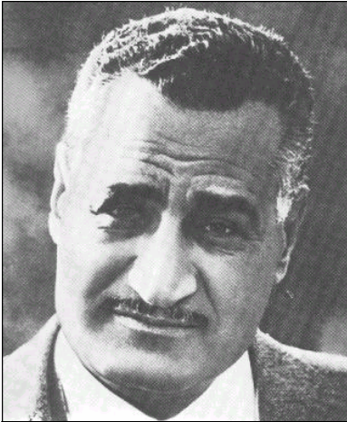
Gamal Abdel Nasser

created the state of Israel. Following months of heightening tension, Israel attacked Egypt in 1967, beginning the Six Day War. Israel destroyed the Egyptian air force, captured Sinai, and closed the Suez Canal. The 1967 war was a disastrous defeat for the Egypt and for Nasser's leadership.